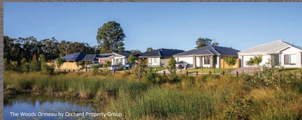
The Woods Ormeau by Orchard Property Group

At the heart of everything we do is the belief that property development is about understanding and meeting the needs of people – now and in the future. Our pride comes from being part of the creation of communities that meet the highest standards of quality, value and liveability. Our focus is on exceeding the expectations of the people that will call our communities home.