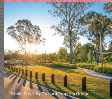
Pebble Creek by Orchard Property Group