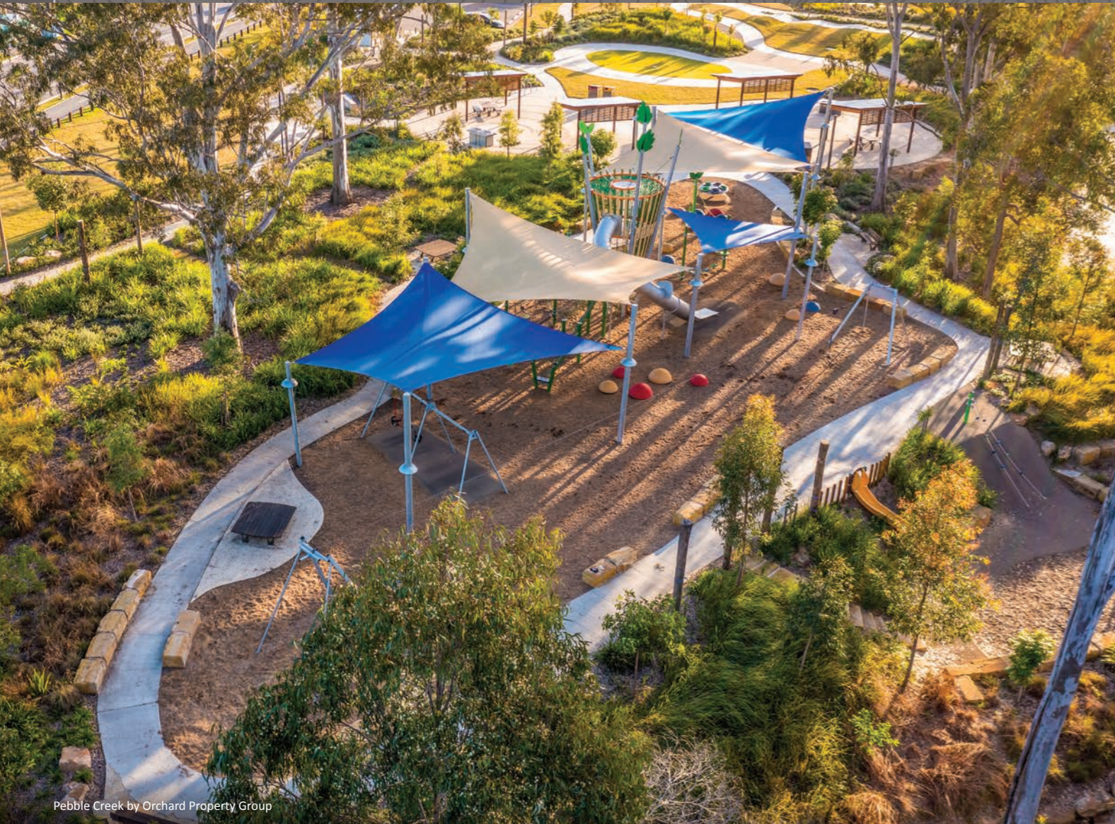
Pebble Creek by Orchard Property Group