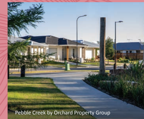
Pebble Creek by Orchard Property Group