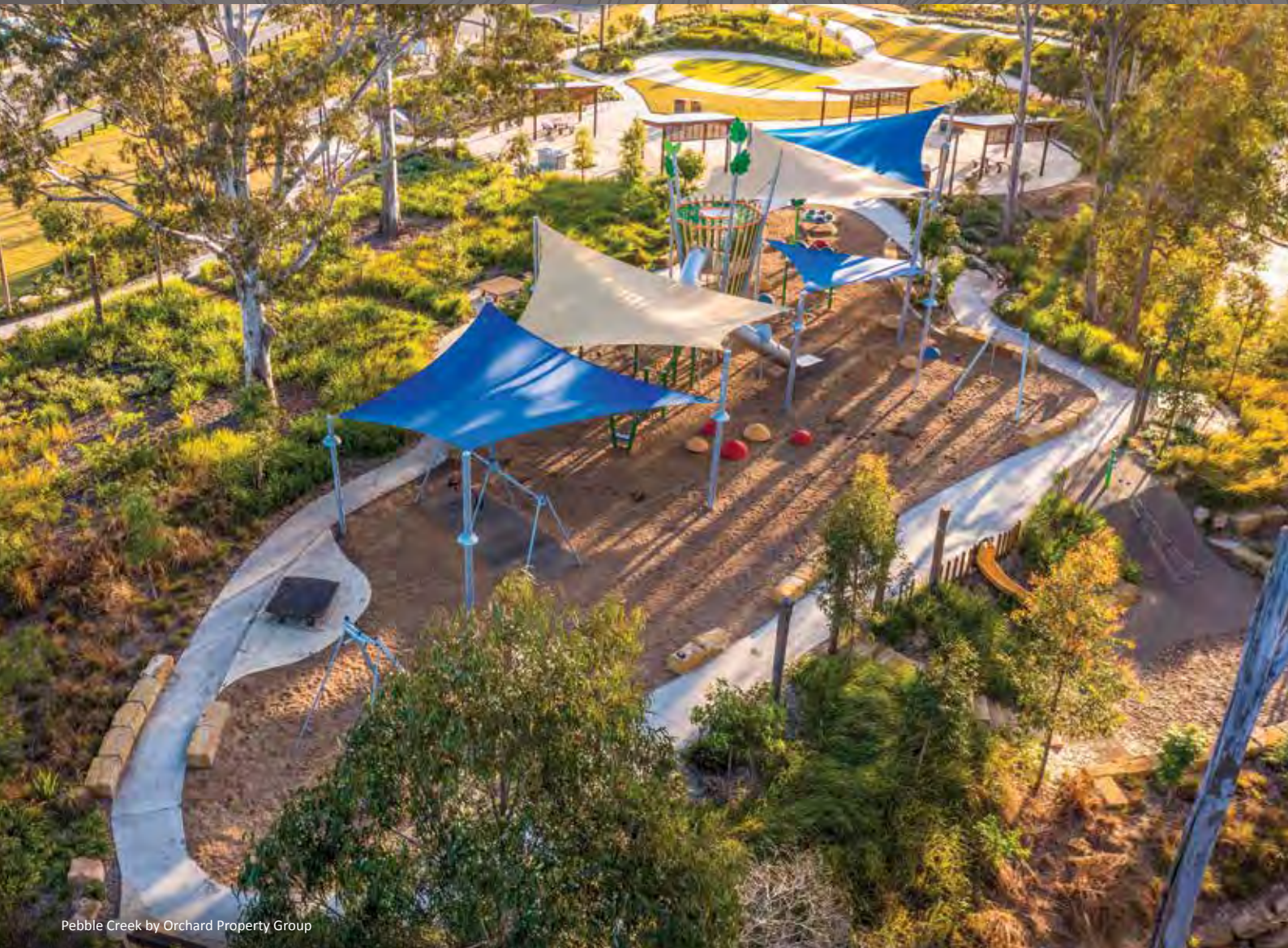
Pebble Creek by Orchard Property Group