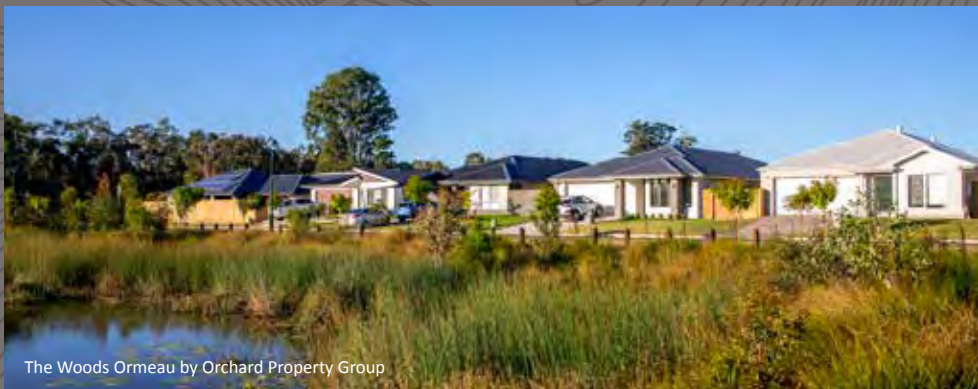
The Woods Ormeau by Orchard Property Group